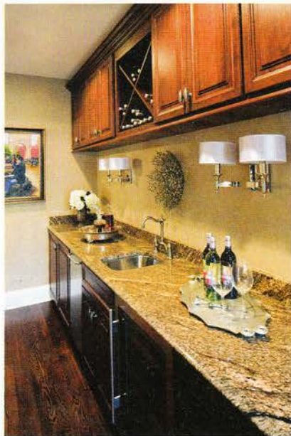
FAMILY TIES The kitchen (top) was designed to be a common area for the family. The butler's pantry (bottom) has similar elements. dbinteriors, llc, designed these rooms and the bar.